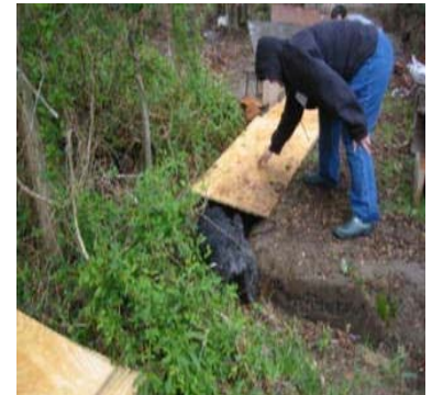
A Kerrie goes to ground!