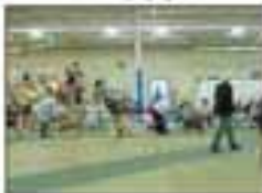
The Terrier Group judging