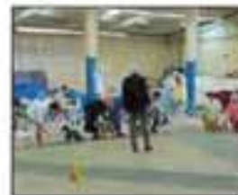
The Terrier Group Judging