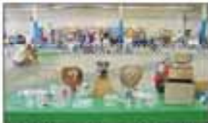
Trophy table for the Irish Terrier Club of Chicago